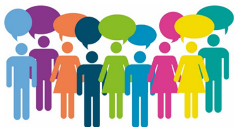
9 Dementia Advisers in Wiltshire

Wiltshire Clinical Commissioning Group (Wiltshire CCG) and Wiltshire Council say work has and continues to be planned, delivered and reviewed around each area that has been commented on by the public in the Healthwatch Wiltshire report.